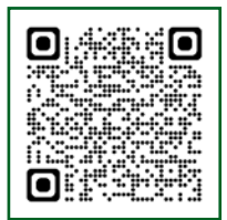
Scan Here for RAMS Athletic Schedules

websites: billingscatholicschoolsfoundation.org billingscatholicschools.org facebook: search Billings Catholic Schools & Billings Catholic Schools Foundation